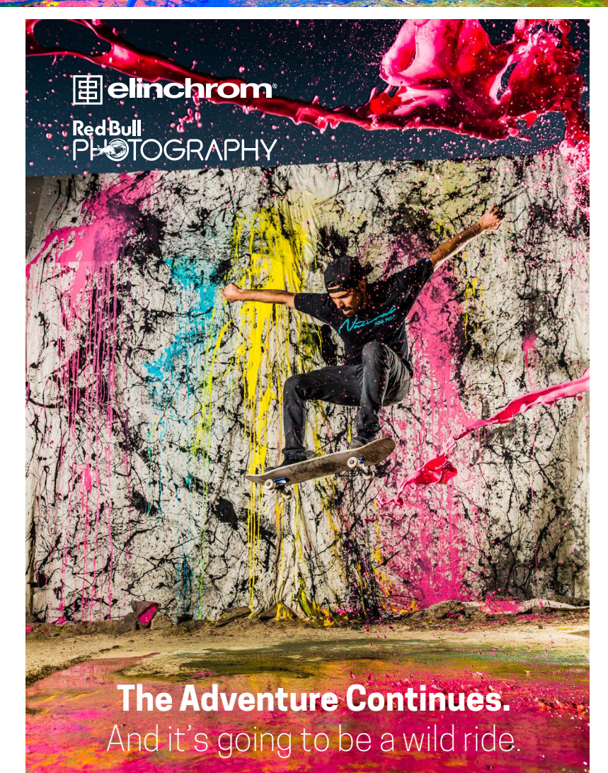
Photo taken with Hasselblad H5D - ISO 100 - 1/750th - F4 - ELB 400 with Action H