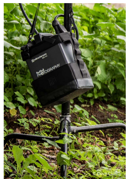
Elinchrom - July 2018